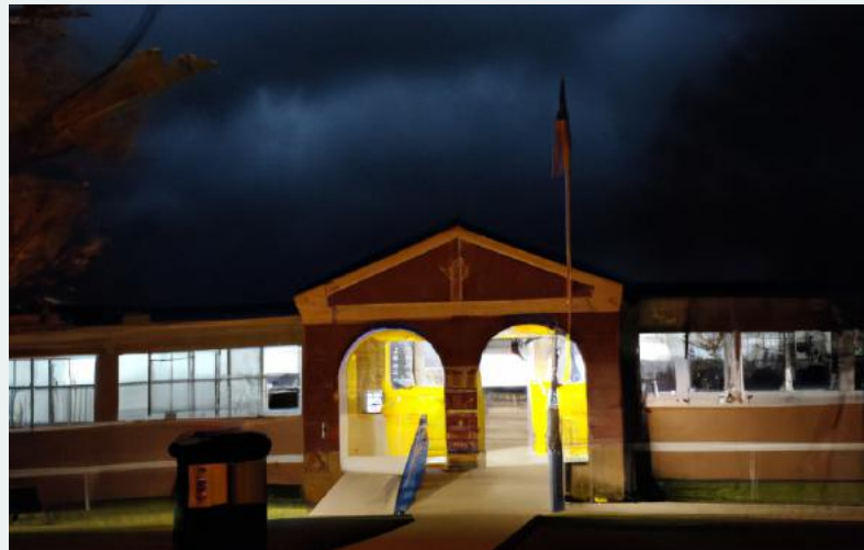
“It was a dark and stormy night at the middle school...”