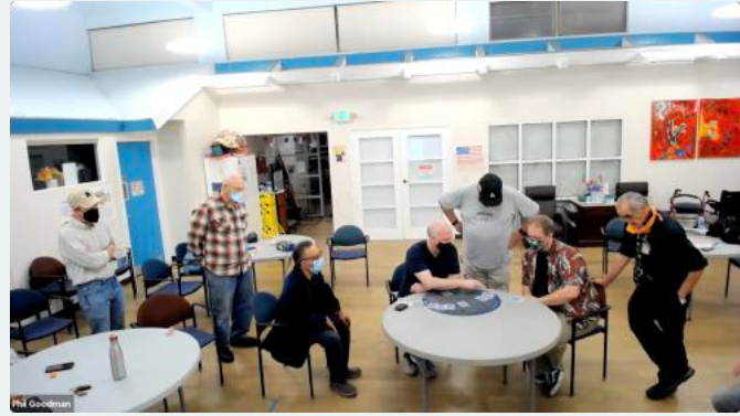
Wizards gather to learn 10-Card Poker

Maybe not, but July’s Westside Wizards meeting felt like a solid step in that direction as club members continued their return to the pre-pandemic rhythm of gathering in-person on the second Tuesday of every month. While members continued to wear masks out of respect for everyone’s health, the magic and camaraderie more than made up for any inconvenience, and those unable to attend in-person were able to participate on Zoom.