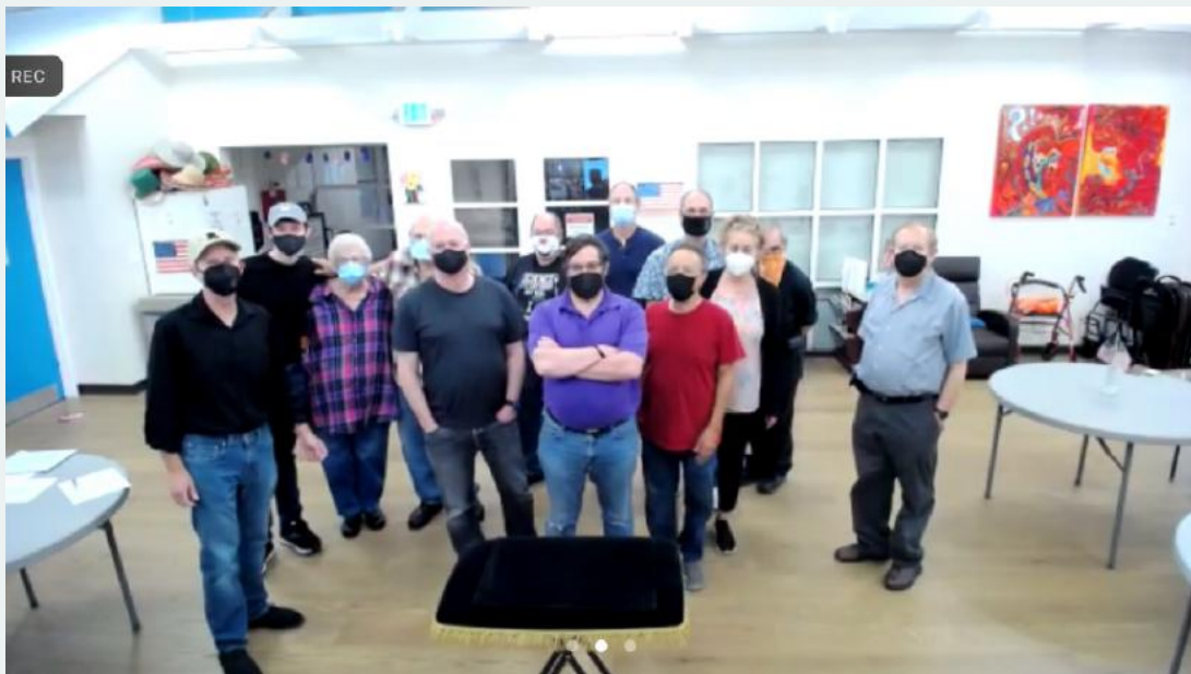
Members come together to say "hi" to everyone on Zoom!