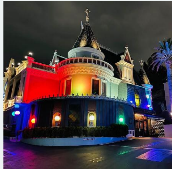
The Magic Castle shows its support during Pride month